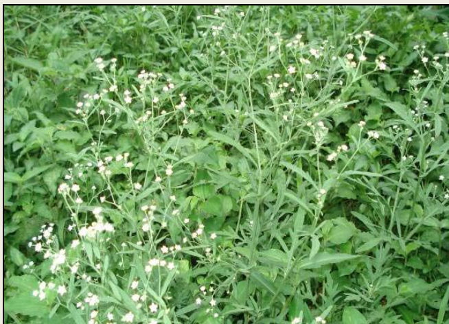
Figure 5: Parthenium weed infestation in Bangladesh.