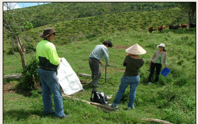
Figure 2. Collecting soil seed bank samples in the field at Kilcoy, south-eastern Queensland.

Community Biodiversity – The impact of parthenium weed upon species biodiversity and composition, both within the above-ground vegetation and in the soil seed bank, were assessed at a pastoral site in Kilcoy (Figure 2). This site has been infested with parthenium weed for more than 10 years. The study has shown that plant diversity (i.e. Shannon's index) is reduced even when parthenium weed is present at low levels (2 plants/m 2 ).