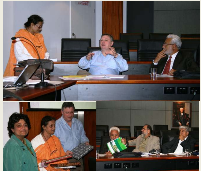
Figure 4: Visit of Pakistani team to the University of Queensland under the HEC linkage project

Lahore District -: Lahore is the second largest city in Pakistan and is the provincial capital of the Punjab. It has an area of 1,772 km 2 with mean maximum/minimum temperatures of 40.4/27.3°C. The first phase of the ecological and phytosociological surveys was conducted between July 2008 and June