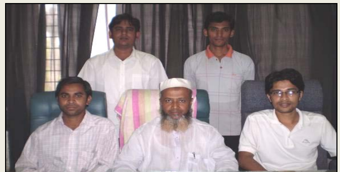
Figure 6: Parthenium weed research group in Bangladesh.

The researchers and research projects are as follows: